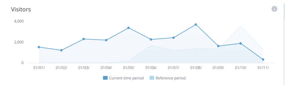
Chart of monthly visitors.

The website has had 22,826 visitors since January.